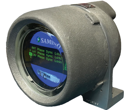
Universal Display in XP enclosure